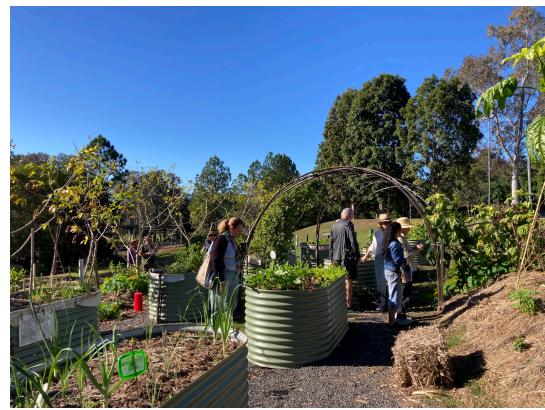
Cooran Community Garden

every garden is different, with varying amounts of community participation and infrastructure. Cooroy have been very fortunate to secure several grants that allowed them to construct a magnificent pavilion which is used by other groups in the community for various events.