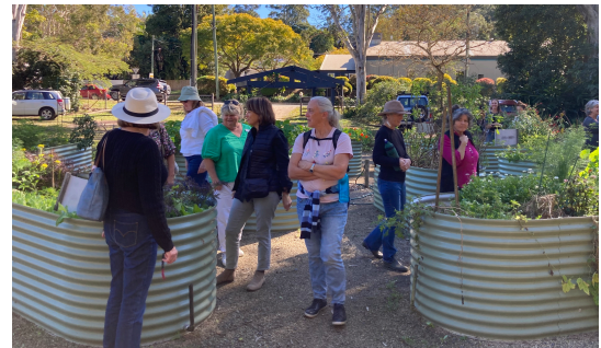
Eumundi Community Garden