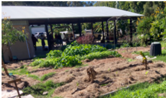
The Pavilion at Cooroy Community Garden