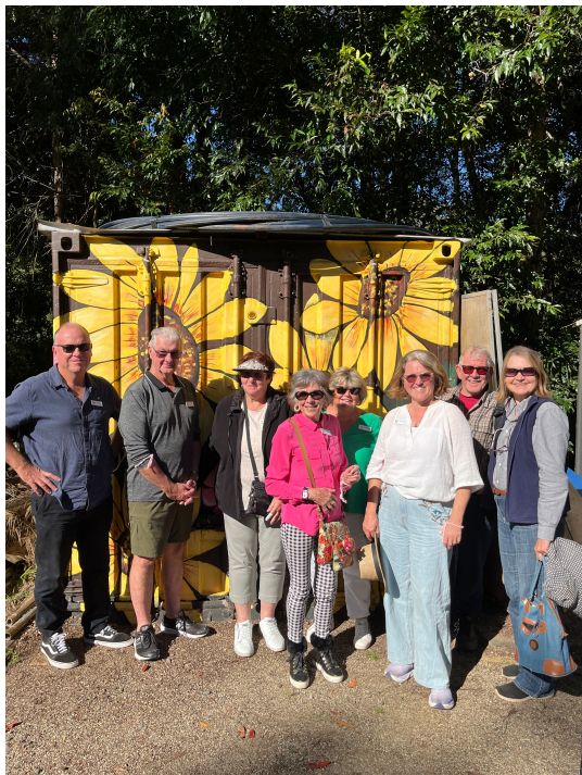
NCG Garden Members at Eumundi Community Garden

Recently eight of our members, at the invitation of the Pomona Community House, joined other interested gardeners from around the region on a very enjoyable bus trip to several local community gardens.